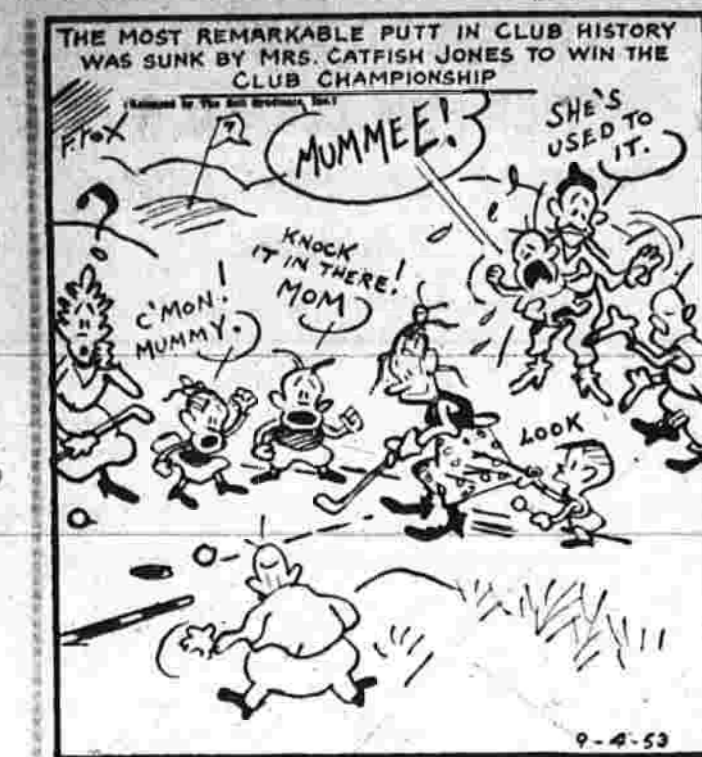
BY FONTAINE FOX